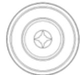
Round Medium Grommet