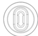
Oval Large Grommet