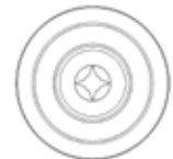
Round Small Grommet