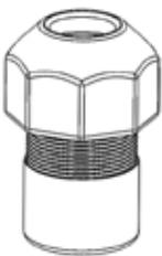
Solvent Cement Body