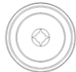
Round Large Grommet