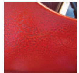
"Cratering" or "Fish Eye" on a Metal Surface