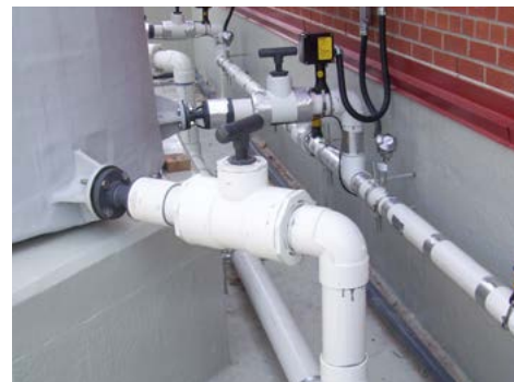
IPEX double containment ball valves were used.

For more than 20 years, Guardian systems from IPEX have been the benchmark in double containment piping in North America. With all the corrosion resistance, performance and longevity benefits of Xirtec140 PVC, the Guardian Vinyl double containment system improves overall safety at the North Toronto Wastewater Treatment Plant, while ensuring reliable service to the surrounding community for the life of the system.