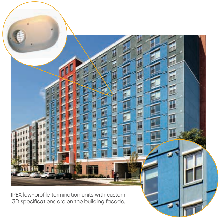
IPEX low-profile termination units with custom 3D specifications are on the building facade.

A major manufacturer of condensing, tankless water heaters, was working with a developer on a 6-storey condominium. Unfortunately, the developer used the spacing requirement specifications for a termination product that was not certified for use with the tankless water heater. To use certified IPEX low-profile termination units, the developer would have to spend tens of thousands of dollars to break the building facade and correct the spacing, which would result in costly delay penalties. The other option was to work with IPEX to certify and manufacture a low-profile termination unit using new custom spacing specifications. 3D-printed parts were created to verify dimensions and to be used for the necessary certification by the appliance manufacturer. Using this process, product development time was reduced by approximately ten weeks and the developer met the closing deadline.