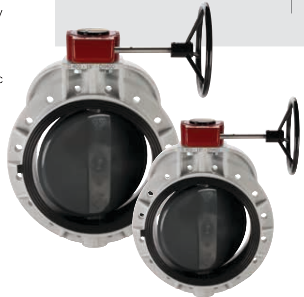
Valve Selection Chart