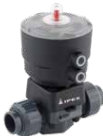
DK Pneumatic Diaphragm Valve Sizes: 1/2" – 2 1/2"