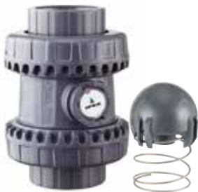
SSE Spring Assisted Ball Check Valve Sizes: 1/2" – 4"