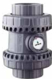
SXE Ball Check Valve Sizes: 1/2" – 4"