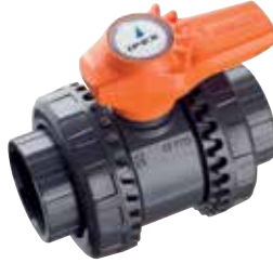
VXE Ball Valve Sizes: 1/2" – 6"