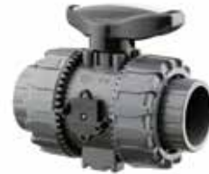
VKD Ball Valve Sizes: 3/8" – 4"