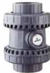
SXE Ball Check Valve Sizes: 1/2" – 4"