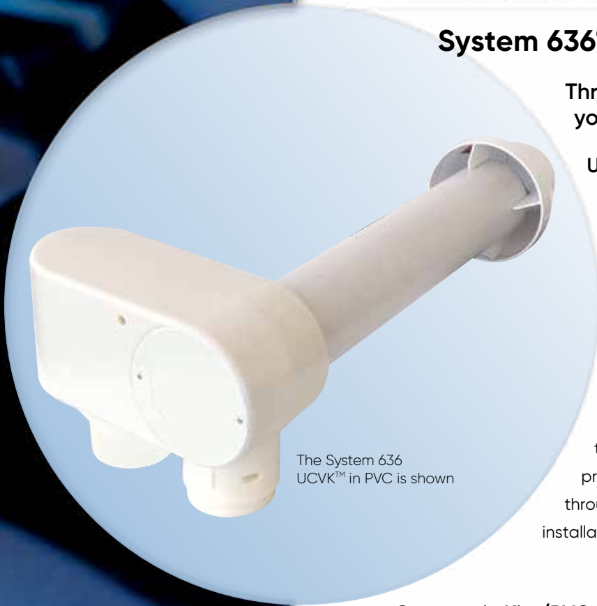
The System 636 UCVK ™ in PVC is shown

Longer barrel length options allow for greater flexibility during installation. Required for steeper pitched roofs, and is ideal for high snow load areas.