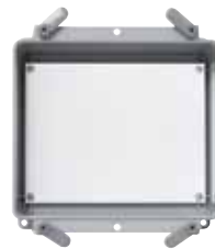
JBXH12106 – JBXH161610