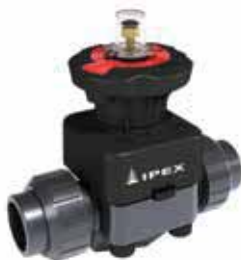
DK Manual Diaphragm Valve Sizes: 1/2" – 2 1/2"