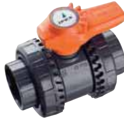
VXE Ball Valve Sizes: 1/2" – 6"