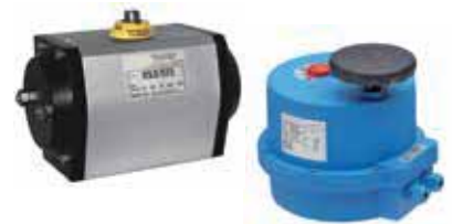
Corrosion Resistant Pneumatic and Electric Actuators 1/2" – 16"