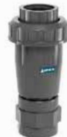
VA Air Release Valve Sizes: 3/4", 1-1/4" & 2"