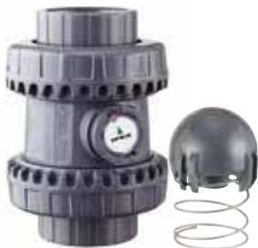
SSE Spring Assisted Ball Check Valve Sizes: 1/2" – 4"