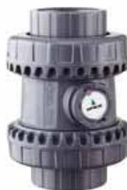
SXE Ball Check Valve Sizes: 1/2" – 4"