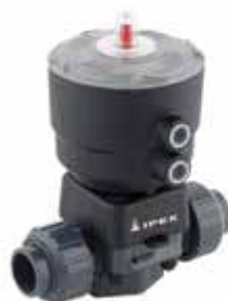
DK Pneumatic Diaphragm Valve Sizes: 1/2" – 2 1/2"