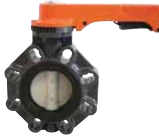
FX Butterfly Valve Sizes: 1 1/2" – 12"