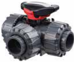
TKD 3-Way Ball Valve Sizes: 1/2" – 2"