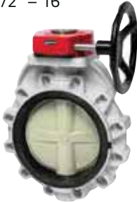
FK Butterfly Valve Sizes: 1 1/2" – 16"