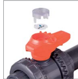
Easyfit Custom Labelling System

D eveloped by Merlin Entertainment, the Sea Life Kansas City Aquarium is a popular destination for both tourists and local residents. Situated in the Crown Center close to Downtown Kansas City, the aquarium boasts 30 special displays, educational programs, touch pools, and a glass tunnel that lets you walk on the simulated sea floor surrounded by water brimming with sea life. In all, the aquarium