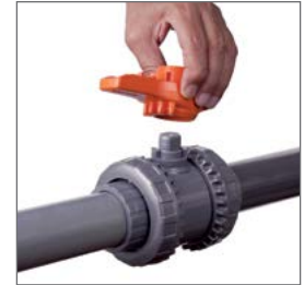
Easyfit Multifunctional Handle