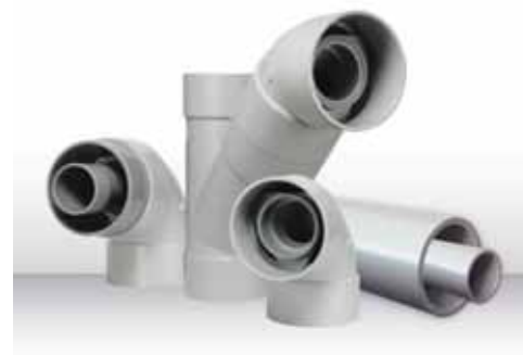
An IPEX innovation that will improve safety and reliability. Should a leak occur, Drain-Guard™ Double Containment DWV will protect people, equipment and valuable property from possible harm.

The MCEE, held in Montréal every two years, is Canada's largest plumbing, HVACR, hydronic, electrical and lighting exposition. With nearly 7,500 attendees, the MCEE is an excellent showcase for manufacturers. Seventy-five percent of the attendees purchase products later based on what they saw at the exposition.